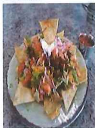
Southern Taco Salad