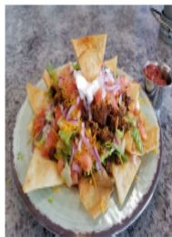
Southern Taco Salad