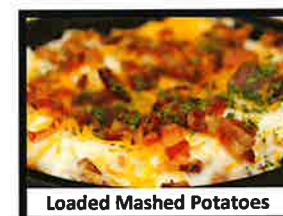
Loaded Mashed Potatoes