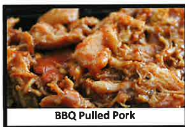
BBQ Pulled Pork

Chicken Noodle Vegetable Beef Beef Stew Cheesy Beer Brat Chicken Dumpling Clam Chowder Broccoli Cheddar Cheesy Hamburger Homemade Chili