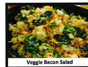
Veggie Bacon Salad

Italian Pasta Super Summer Hawaiian Chicken Shrimp Salad Tuna Salad Macaroni Salad BLT Pasta Sicilian Pasta Parmesan Peppercorn Bacon Ranch Lemon Crab Garlic Tortellini Seven Layer Pasta Garden Ranch