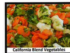
California Blend Vegetables