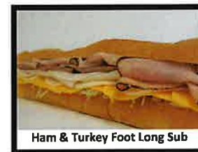
Ham & Turkey Foot Long Sub

*Grilled Vegetables Buttered Noodles White Rice Bread Dressing Sauerkraut Sweet Potatoes Baked Beans